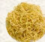
E-Fu Noodles 伊面