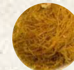
Glass Noodles 粉絲