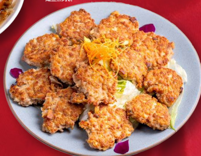
Pan Fried Minced Pork Cake with Grind Salted Fish 咸鱼煎肉饼