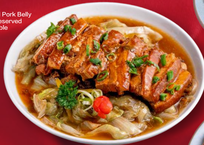
Braised Pork Belly with Preserved Vegetable 梅菜扣肉