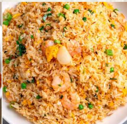
The Jumbo Fried Rice 珍宝炒饭