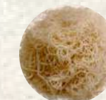
Rice Vermicelli 米粉