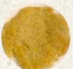
Crispy Rice Vermicelli 脆煎米粉

GF Gluten-Free | Contains Nuts | Chilli Hot