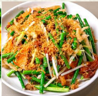
Stir-fried King Hometown Style 家乡小炒王