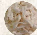
Flat Rice Noodles 河粉