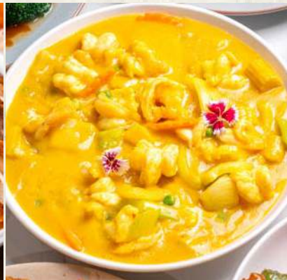
Curry Prawns 咖喱虾球