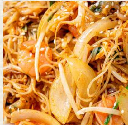
Singapore Fried Noodles 星洲炒米