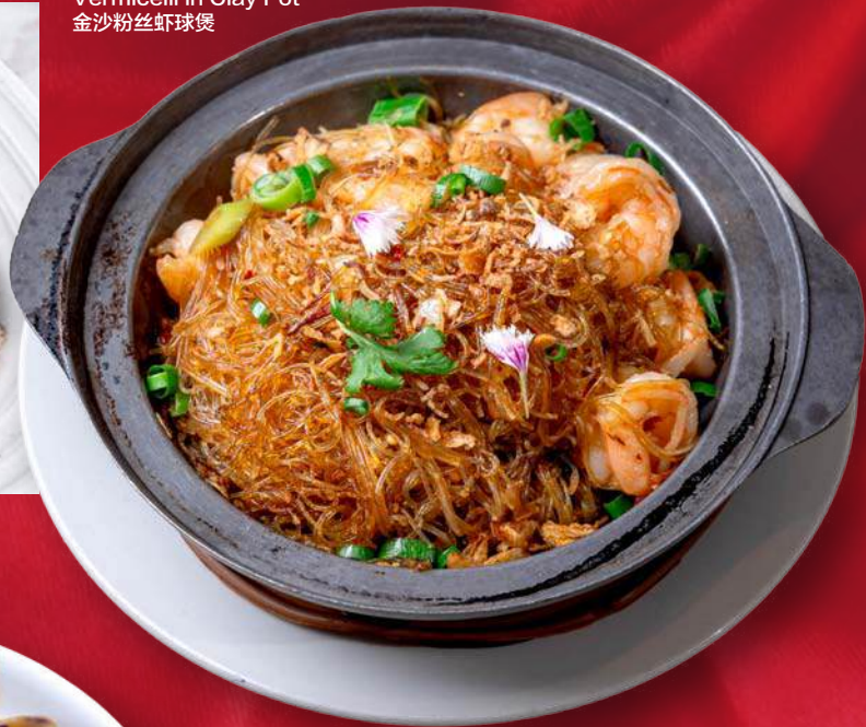
King Prawn with Vermicelli in Clay Pot 金沙粉丝虾球煲