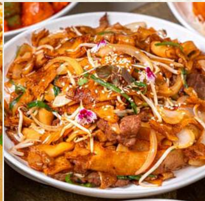
Stir-fried Beef Flat Noodles 干炒牛河