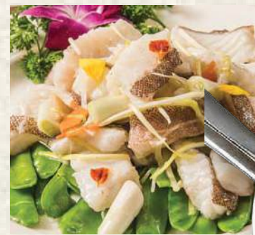
Stir-Fried Coral Trout with Snow Peas & Black Fungus 星斑炒荷兰豆云耳