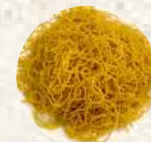
Thin Egg Noodles 幼蛋面