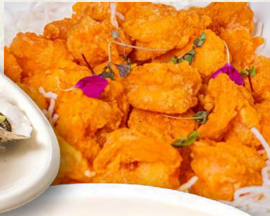
Deep-fried King Prawns coated with Salted Egg Yolk 金衣虾球