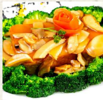
Deep-Fried Jade Tofu with Mushroom & Veggies 翡翠豆腐